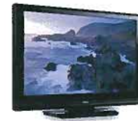
Television shown is for display purposes only.

Visit the Parade of Homes Tour and enter a chance to win a Television courtesy of Hayes Sight & Sound!